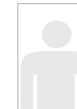
Integrated Expert .....